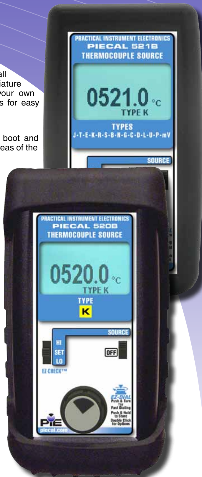
Actual Size (Shown with optional boot)