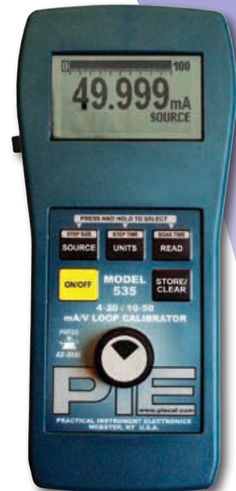
Model 535 4-20 / 10-50 mA and Voltage Calibrator