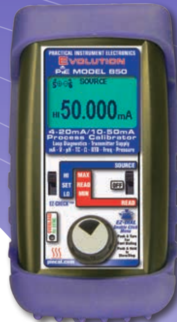
Model 850 4-20 / 10-50 mA Multifunction Calibrator

The 2-Wire transmitter simulator function of the PIE Models 535 & 850 operate with loop voltages from 2 to 90 V dc where the competitive models are rated for 5 to 60 V dc. If the competitive calibrators are connected to a loop with an older power supply with greater than 60 V dc they will blow an internal fuse.