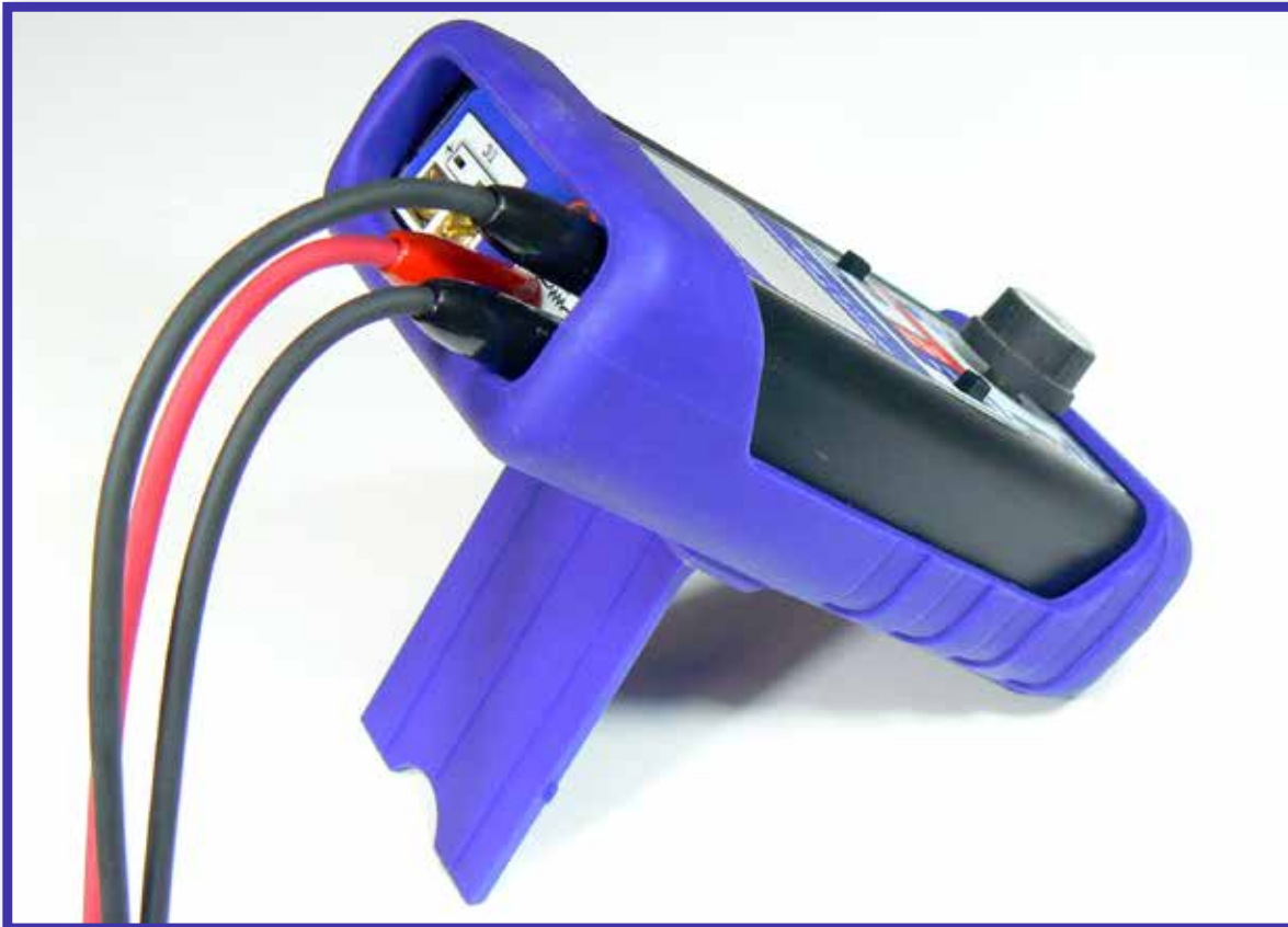
Flip out stand for bench use