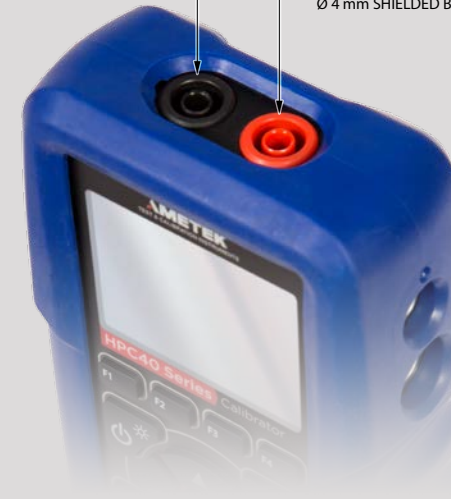
mA CONNECTIONS Ø 4 mm SHIELDED BANANA JACKS