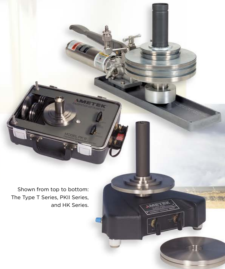
Shown from top to bottom: The Type T Series, PKII Series, and HK Series.