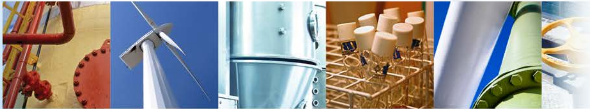
The CSC201, mAcal, and 24VDCPS.