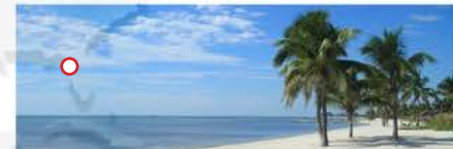
Largo, FL USA Mansfield and Green

M&G designs and manufactures a variety of deadweight testers, hand-pumps, and comparators, for field and lab use from our ISO 9001 certified facility.