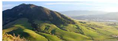
San Luis Obispo, CA USA Crystal Engineering

Combined with our software engineering and research office in India, our various sales and service centers, and over 150 distributors around the globe, our world-wide presence allows us to provide outstanding service no matter where you are!