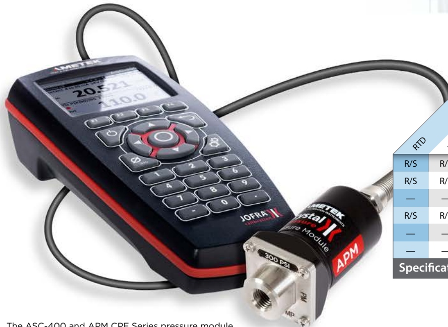
The ASC-400 and APM CPF Series pressure module.

If you don't need the advanced features found in our multifunction calibrator, our single task instruments, including the mAcal, CSC Series, and 24VDCPS, make calibrating instruments like pressure transmitters fast and easy.