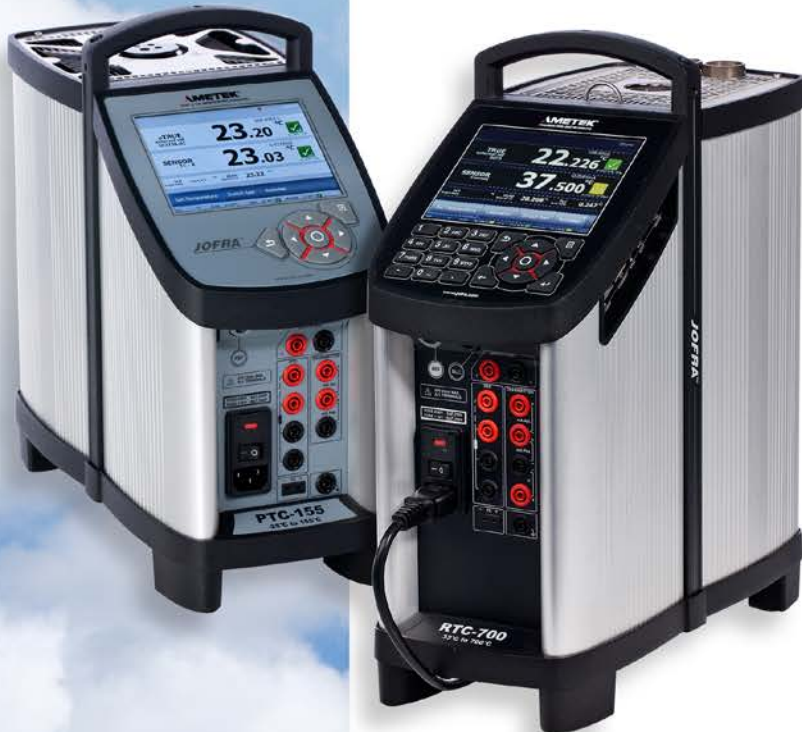
The PTC-155 and RTC-700.

One Crystal pressure product often does the work of three to five devices from other manufacturers — replacing your data logger, your chart recorder, multiple test gauges, and even a dead-weight tester with a single device.