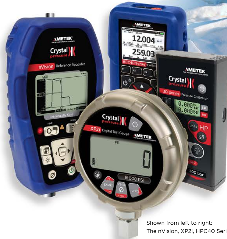
Shown from left to right: The nVision, XP2i, HPC40 Series, and 30 Series.

Our JOFRA dry-block temperature calibrators are the fastest solution available for accurately calibrating temperature. One high speed calibrator reduces test time while also offering automated, hands-off operation, allowing a technician to complete multiple tasks simultaneously. We even have a model that only requires calibration once every three years!