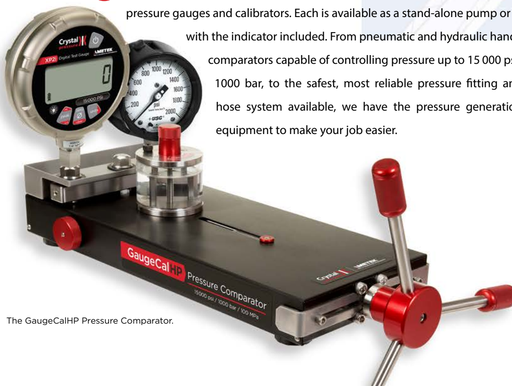
The GaugeCalHP Pressure Comparator.

O ur pressure hand pumps, comparators, and fittings & hoses are the perfect complement to our popular pressure gauges and calibrators. Each is available as a stand-alone pump or part of a complete system with the indicator included. From pneumatic and hydraulic hand pumps, to pressure comparators capable of controlling pressure up to 15 000 psi / 1000 bar, to the safest, most reliable pressure fitting and hose system available, we have the pressure generation equipment to make your job easier.