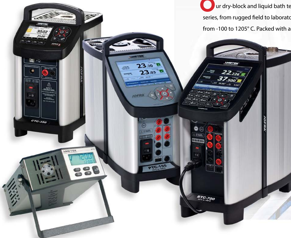
Shown from left to right: The ETC, CTC, PTC, and RTC.